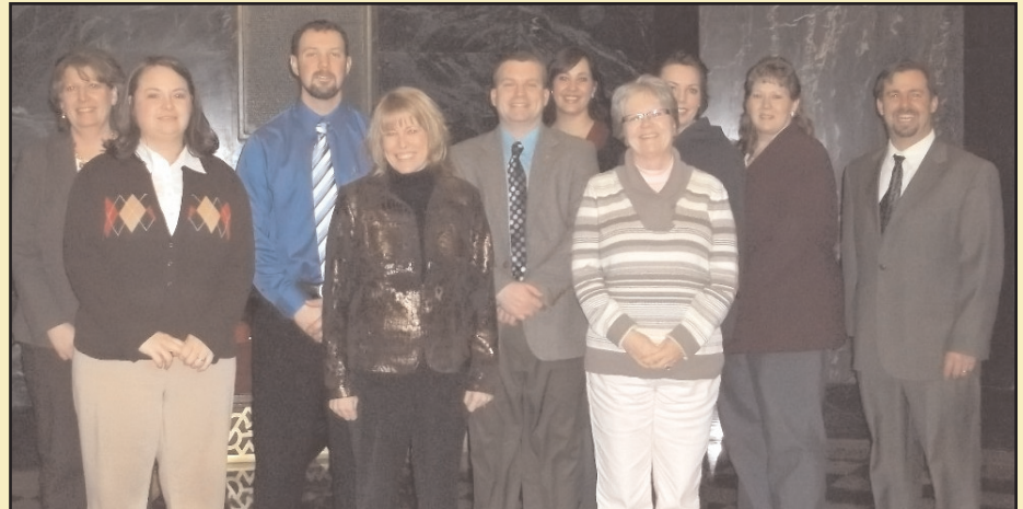
DELTA Students pause in the Capitol Rotunda during their trip to Lincoln.

Ten members of the Dawes County Entrepreneur and Leadership Training Academy (DELTA) class of 2011 had the opportunity to visit Lincoln the first week of February. They attended with the Leadership Scottsbluff class and were treated to several hours of the Governor and First Lady's time at the residence. The informal conversation and visit helped them realize the Governor is first and foremost a man who believes in the future of Nebraska. He has a dog (Snickers) and believe it or not, puts