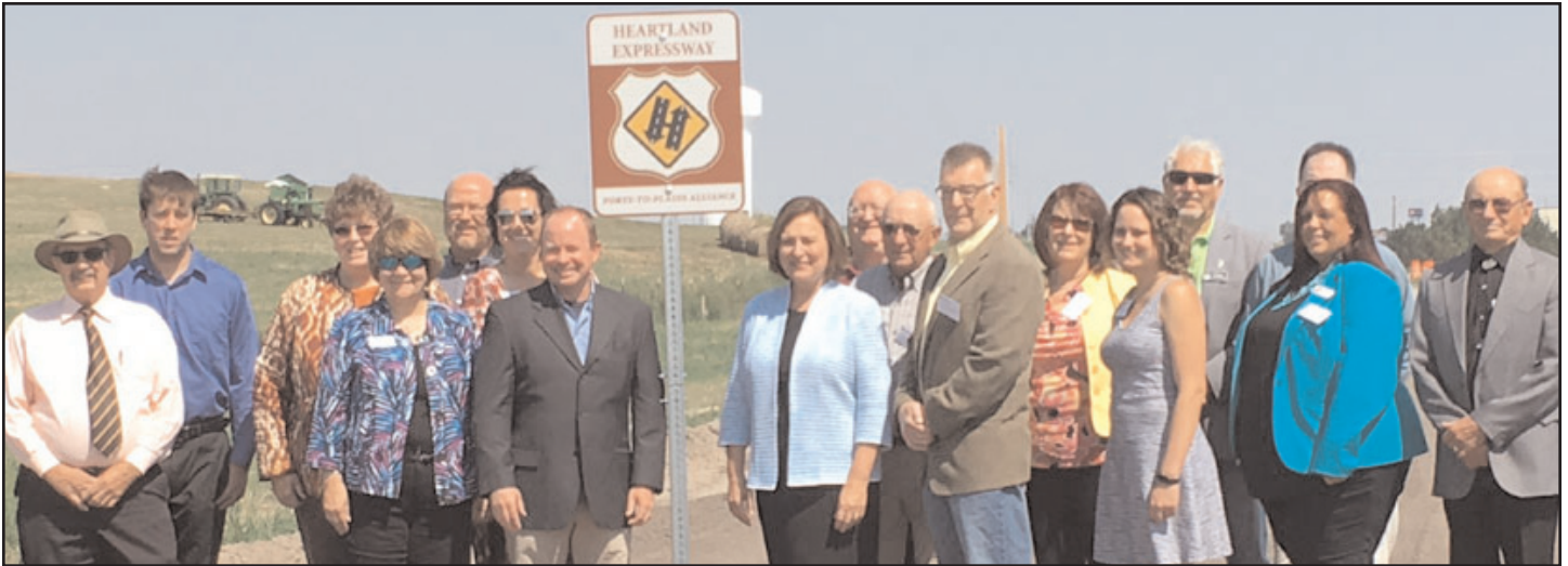
Members of the Heartland Expressway Association and elected officials gathered with US Senator Deb Fischer for an official unveiling of