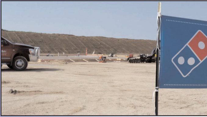
Floor poured: Progress continues on the Domino's project across from Quality Tire on West Sixth St. Their goal is to be open before Christmas.