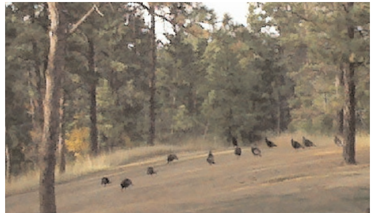
Turkeys greeted the hunters on the grounds at Chadron State Park as they gathered for the Pine Ridge Wild Turkey Hunt banquet last year.

One of the most over-looked benefits is the chance for our generous land owners to share their struggle to make a living off the ranchland they call home. It is not as easy as logistics, inventory supply chains or customer interface. Agriculture is a people to people business, dependent on mother nature and global markets. It is important for our government leaders and elected officials to see that first hand. And this project helps do that. It is also important to see our leaders in a setting where they are on our turf, so to speak. It's a lot easier to talk to them. And we are pleased to offer our sponsoring busi-