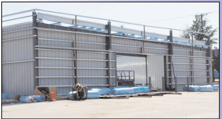
Dollar General is building a new facility on the east side of Chadron, next to the State's HHS offices, across the highway from the New Leaf.