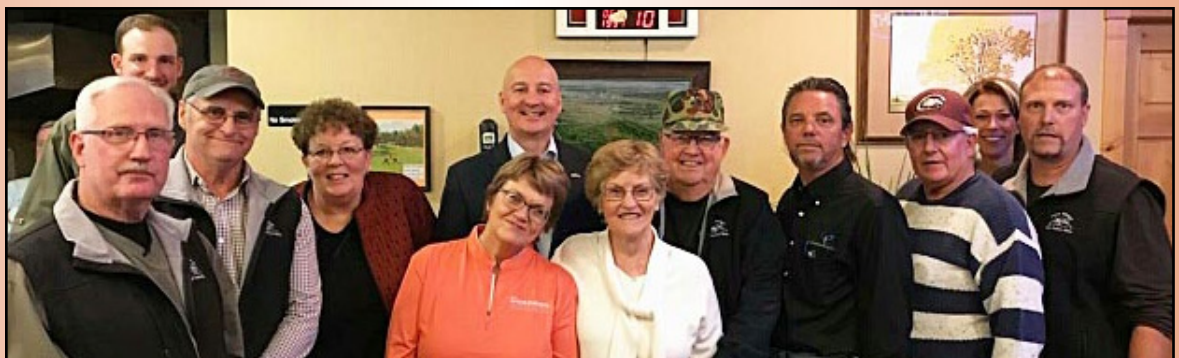
NNDC Committee and Governor

If there is a group interested in taking this event on, permanently, NNDC will be happy to share contacts, ideas, past vendors and sponsors, processes – all the things that are needed to host this event each year. We hope someone will step up and take it on, as it is a worthwhile effort to stay connected with folks who can assist Dawes County in days and years to come. Thanks for the support, it's been a great ride.