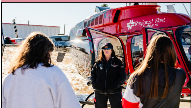
Air Link made an appearance at the hospital.