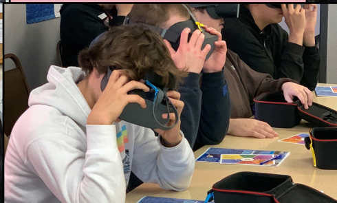
NPPD - Virtual Reality Goggles