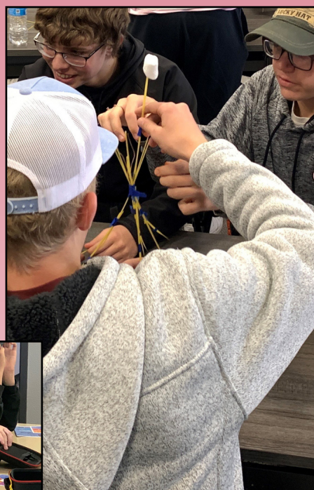
New Leaf - Construction