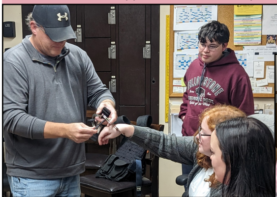
Chadron Police Department