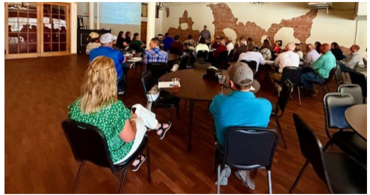
Crowd at Annual Meeting

This is an enormous task, and one that may take multiple attempts. The Ports to Plains board feels as though the administration currently in office may be receptive to a large-scale, nation-wide impact program. The results may not be fully realized for years, but it is something that